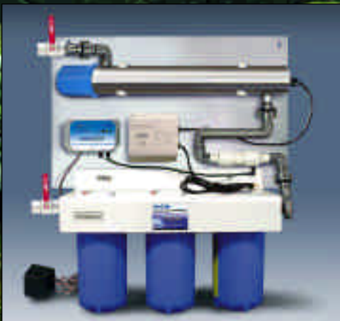
TWT-POEPOUV-604 (4 GMP)