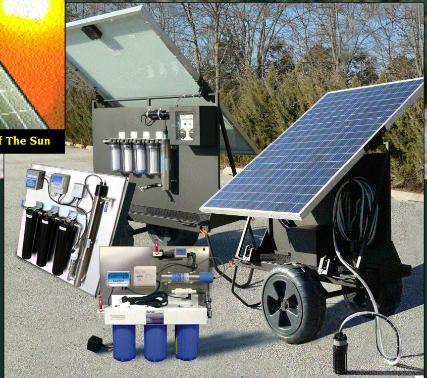
Renewable Energy Wheels

Explore New Innovative Ideas Using Mobile Solar Power with TWT® Chemical-Free Water Treatment Technology. The Most Economical and Effective Way To Produce Safe Drinking Water Anywhere... AnyTime!