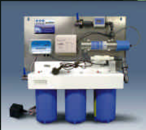
TWT-POEPOUV-600 (2 GMP)