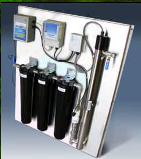
TWT-MD1003 (8 GMP)