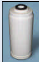
(10" BB) GAC