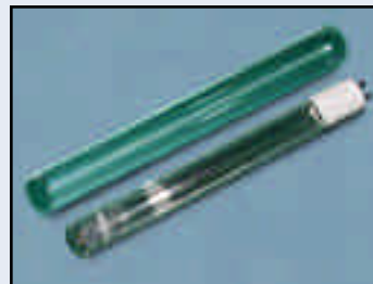
UV Quartz Sleeve / UV Lamp