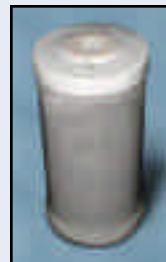
(10" BB) Carbon