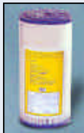
(10" BB) Sediment