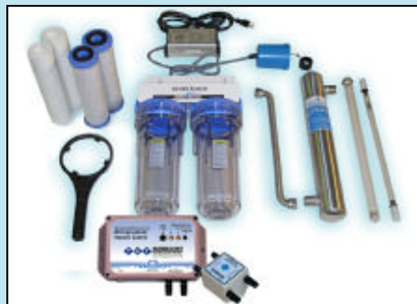
#TWT-AIOKIT: 4 GPM – For pipes up to 3/4" in diameter