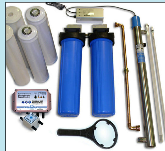
# TWT-AIOKIT: 12 GPM – For pipes up to 1" in diameter