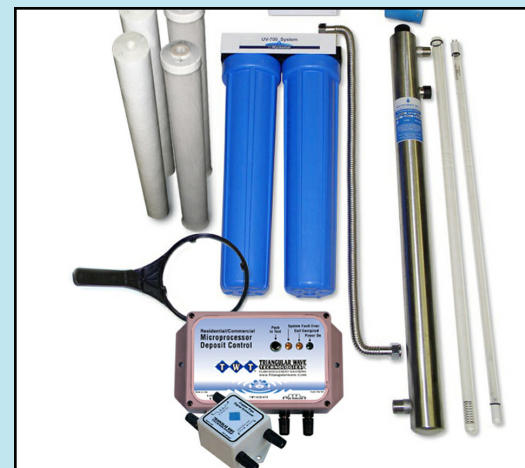
# TWT-AIOKIT: 8 GPM – For pipes up to 1" in diameter

Note: Kits are available in 110/20-V or 220/30-V Must specify with Purchase Order.