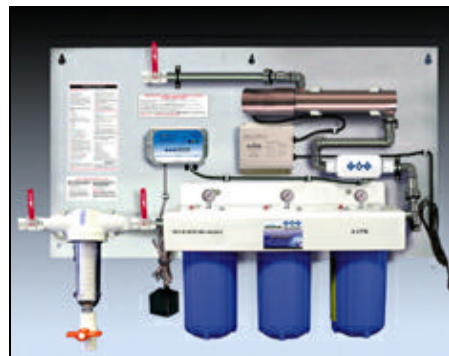
TWT-POEPOUV-604SC4 4 GPM Approx Size: 44"W x 31"H x 10" D Weight: approx. 52 lbs. (will vary based on filters used) 3/4" in/out