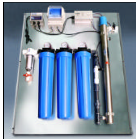
TWT-1003SC 8 GPM Approx Size: 49"W x 31"H x 10" D Weight: approx. 80 lbs. (will vary based on filters used) 3/4" in/out