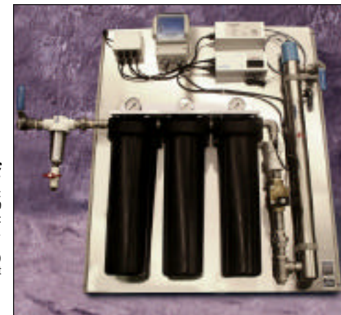
TWT-MD-1004SC 12 GPM Approx Size: 40"W x 43"H x 10" D Weight: approx. 83 lbs. (will vary based on filters used) 1" in/out