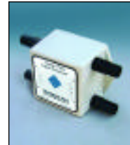
TWT-CSE-0227- for copper pipes only 2" or less in diameter The copper signal enhancer is a passive signal / impedance matching circuit. This device provides a power boost to the conditioning signal in copper pipes.