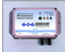
TWT-5C8-472 Residential / Commercial Deposit Control System For Pipes 1 inch or less in diameter- 9 vdc transformer

Products not to scale for reference only