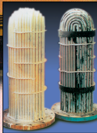
Encrusted Heat Exchangers

The Bypass system offers a much sought after solution at an economical price. Enhancing water quality, improving operating efficiency and equipment life cycle.