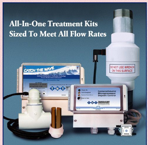
Deposit Control Technology Combined with IonGuard Disinfection & Purification

The IonGuard Purification System is an electrolytic copper /silver ion generator. The system units contain specially cast copper/silver alloy electrodes. These electrodes are mounted in a housing designed for easy access. Integrated with TWT deposit control technology (hard water conditioning & treatment) for enhanced results.