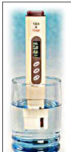
Pocket size hand-held meter

If the instrument you desire is not listed, please E-mail us at: info@triangularwavewave.com with your requested product information.