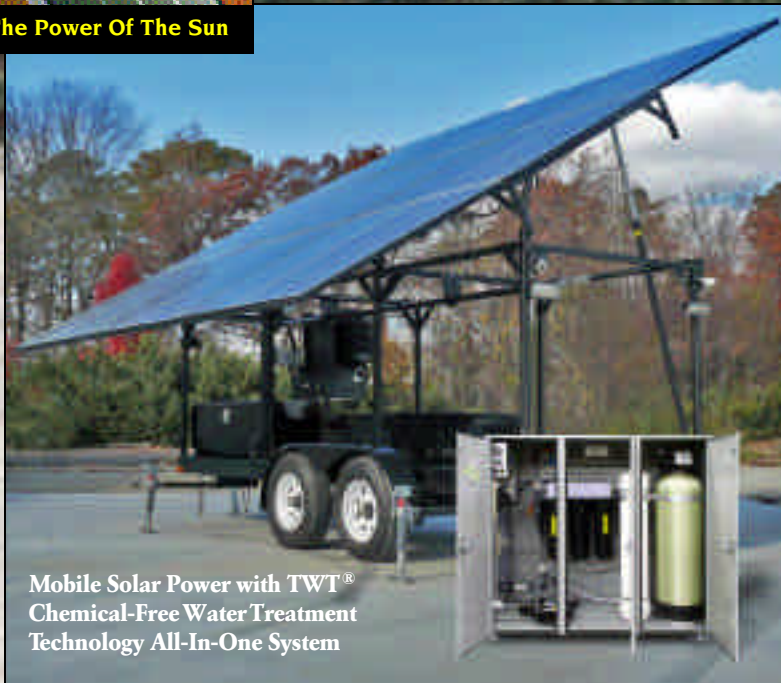
Mobile Solar Power with TWT® Chemical-Free Water Treatment Technology All-In-One System

Mobile solar powered units are system integrated, engineered and designed to produce safe drinking water dependably and economically from a wide range of problem input sources. The systems are well suited for various applications in areas with no power and poor water quality.