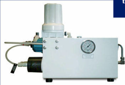
Sea Water RO On-Board Desalination Systems

DON'T WAIT... Contact your distributor or TWT today for a free consultation! And for information on what TWT system will meet your specific application needs!