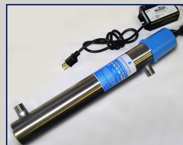
On-board (UV) Ultra Violet Water Disinfection & Purification Systems