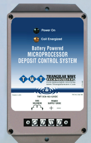
TWT Patented Deposit Control Technology